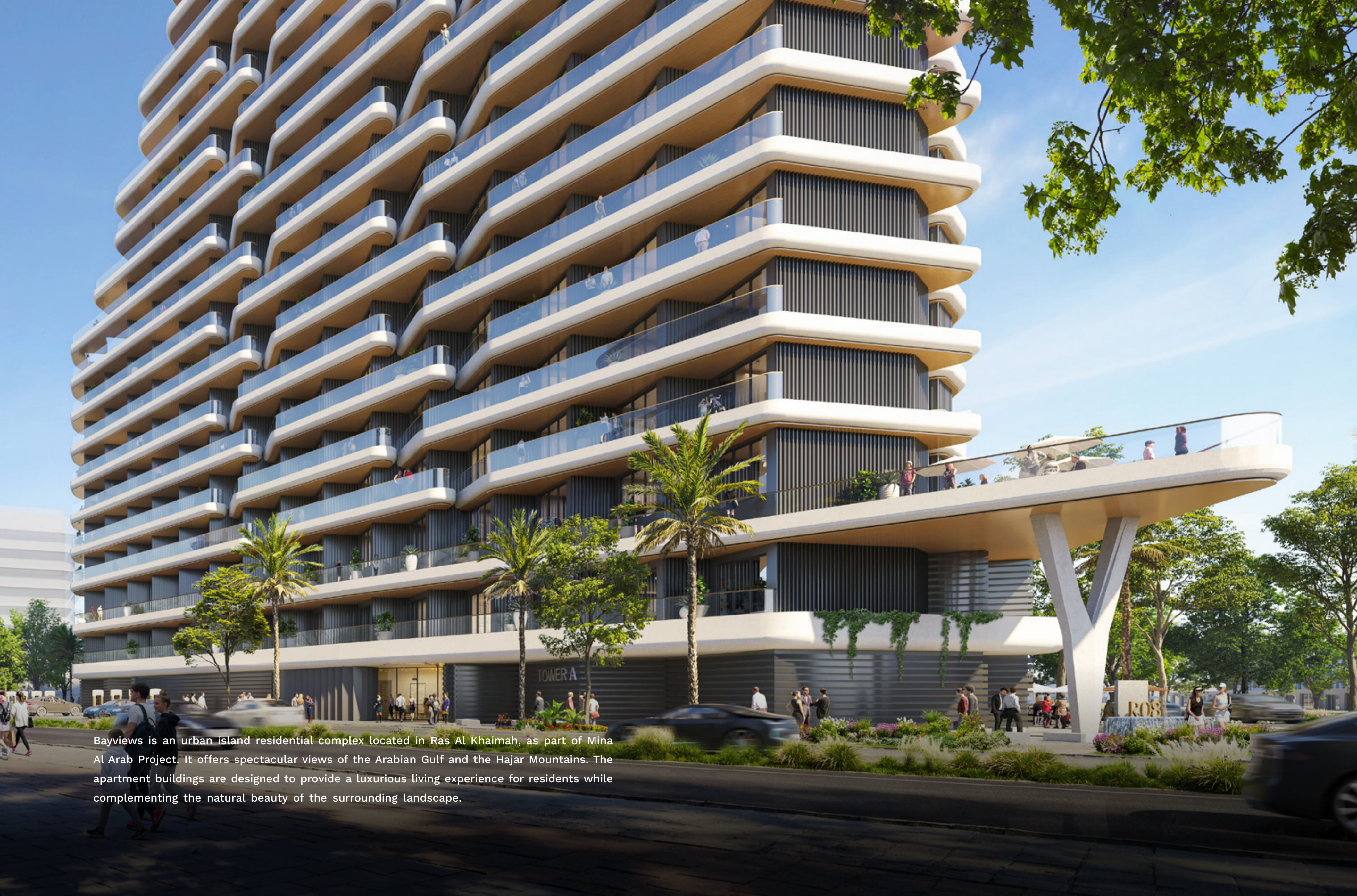
Bayviews is an urban island residential complex located in Ras Al Khaimah, as part of Mina Al Arab Project. It offers spectacular views of the Arabian Gulf and the Hajar Mountains. The apartment buildings are designed to provide a luxurious living experience for residents while complementing the natural beauty of the surrounding landscape.